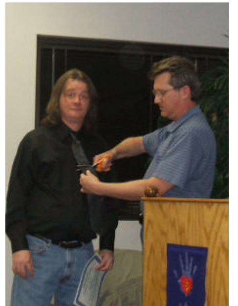
Our latest soloed pilot