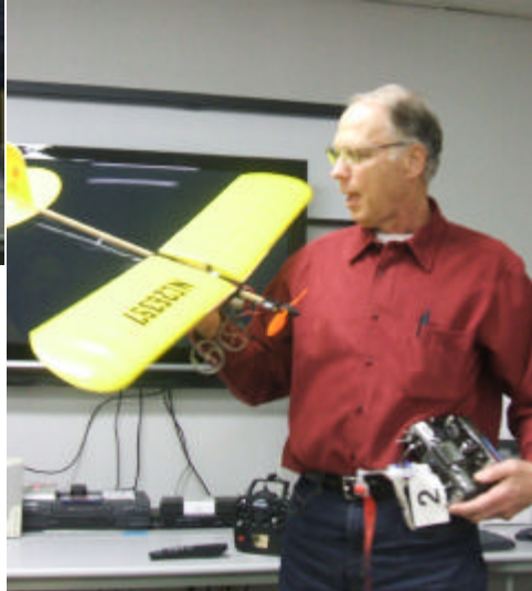
One real sweet ducted fan! →