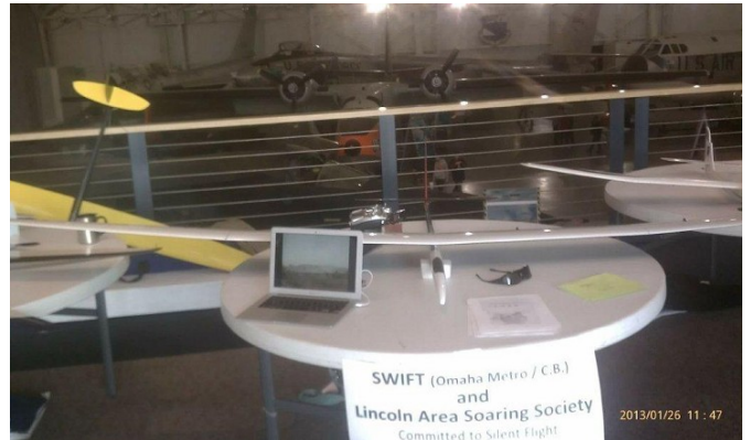
2013 LASS Display